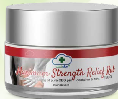
10% EMU Oil 60ml 150mg