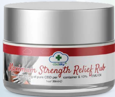
10% EMU Oil 30ml 60mg