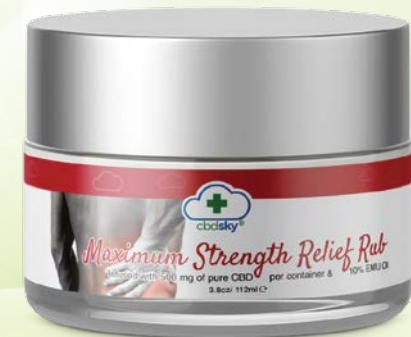
10% EMU Oil 112ml 500mg