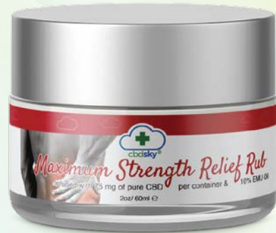
10% EMU Oil 60ml 75mg